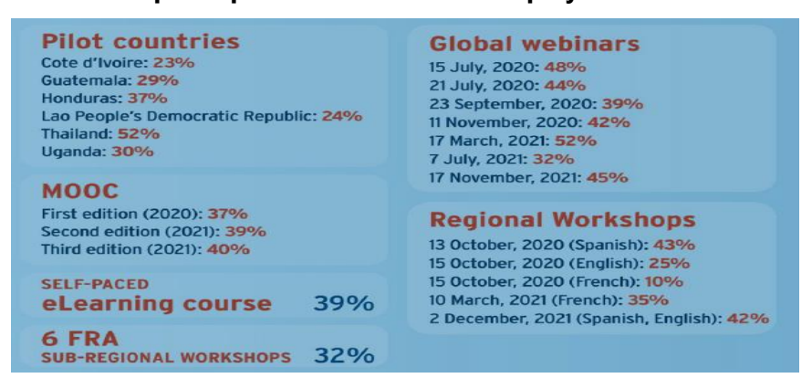
Figure 3. Share of female participants in the CBIT-Forest project activities 10