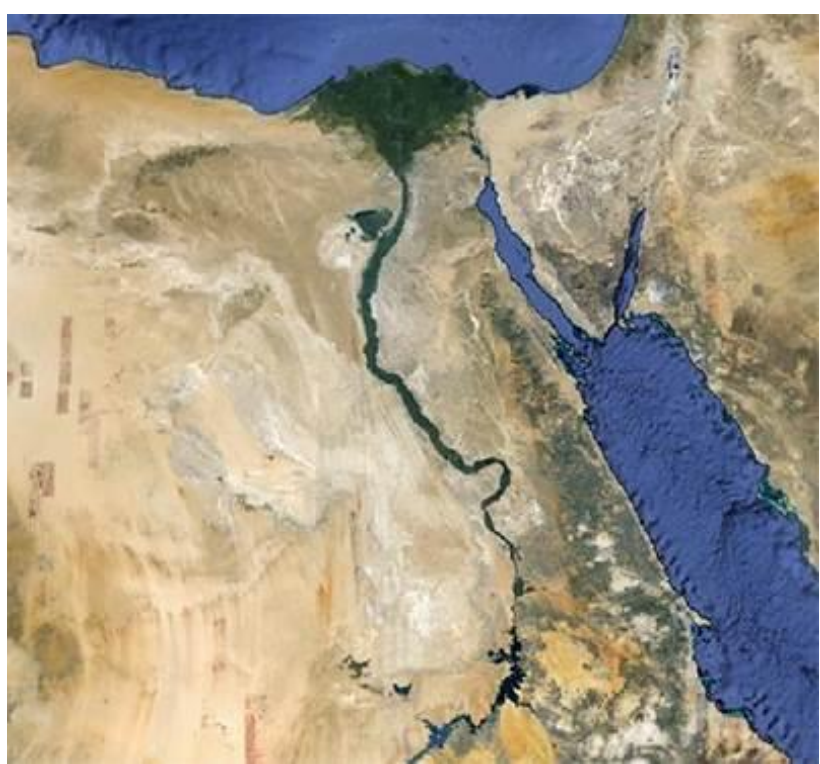
March 2018 Evaluation Office of UN Environment