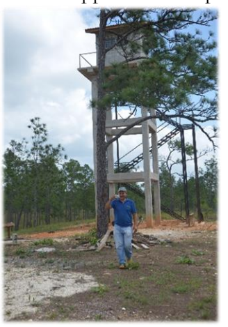
Figure 3: Fire observation tower built with CLIFOR funds near Mabita.

and annual losses caused by fires set by humans have dropped, at least in pine forest areas around the pilot sites after continuous vigilance was carried out and elevated observations were made from a tower built with funds from the CLIFOR project. Mábita shareholders involved with the red macaw and fire prevention activities stressed the importance of the tower and how they have been able to spot fires early in their development. However, a considerable amount of work is still needed to change attitudes in the Moskitia regarding the controlled uses of fire, and it is likely to be a lengthy process before lasting changes are the rule, rather than the exception. For example, the available evidence suggests