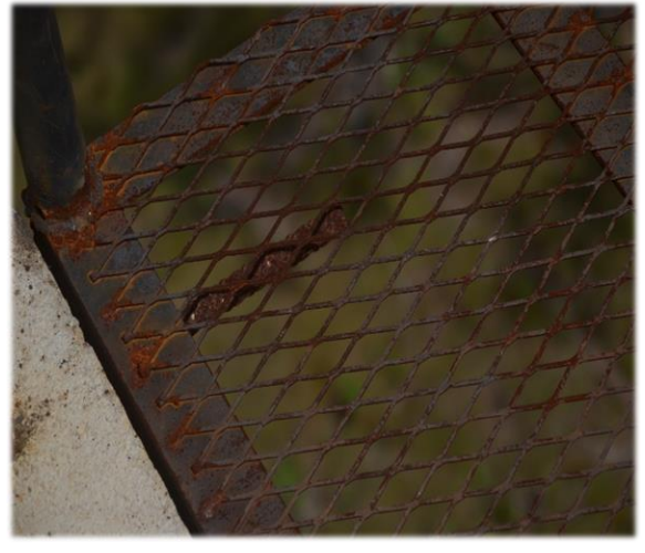
Figure 4: Platform and starinvay at the highest level of a CLIFOR-funded fire observation tower showing high levels of rust and unsafe conditions.

management plan that includes indigenous norms for artisanal fishing. Additionally, it led to ICF acknowledging the importance cultural context implementation modalities for the Moskitia, and the institution has ensured that new future projects (e.g., CLIFOR) will take this new knowledge into account during the implementation of new projects in the region. However, during the field visit, it was noted that the CLIFOR-funded fire prevention observation tower near Mábita was made with such low grade iron that it has rusted and presents a safety risk to people who use it. Unfortunately, the investment will not last.