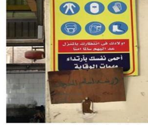
Safety signs inside the lab site