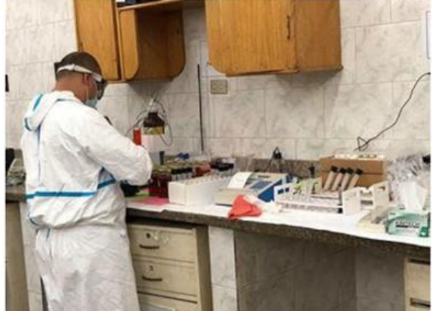
Main lab of South Cairo Electricity Distribution Co.