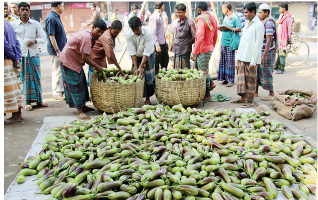
Photo Source: Dhaka Tribune, July 2018 Farmers busy selling Bt brinjal at a village market

Bangladesh is developing a vibrant Biotechnology sector to boost agriculture sector, improve food security and small farmers incomes. GMO Bt Brinjal (Egg Plant) is cultivated by around 27.000 farmers (2018) and four other GMO crops are in an advanced state of field trials (Potato, Cotton, vitamin-A enriched Golden Rice and High Iron and Zn Rice). As underlined in the Project Document "Current development and perspectives of GMOs open-field cultivation highlights the role and the need of a fully operational National Biosafety Framework providing appropriate measures of environmental safeguard, and mechanisms of Biosafety regulation and control".