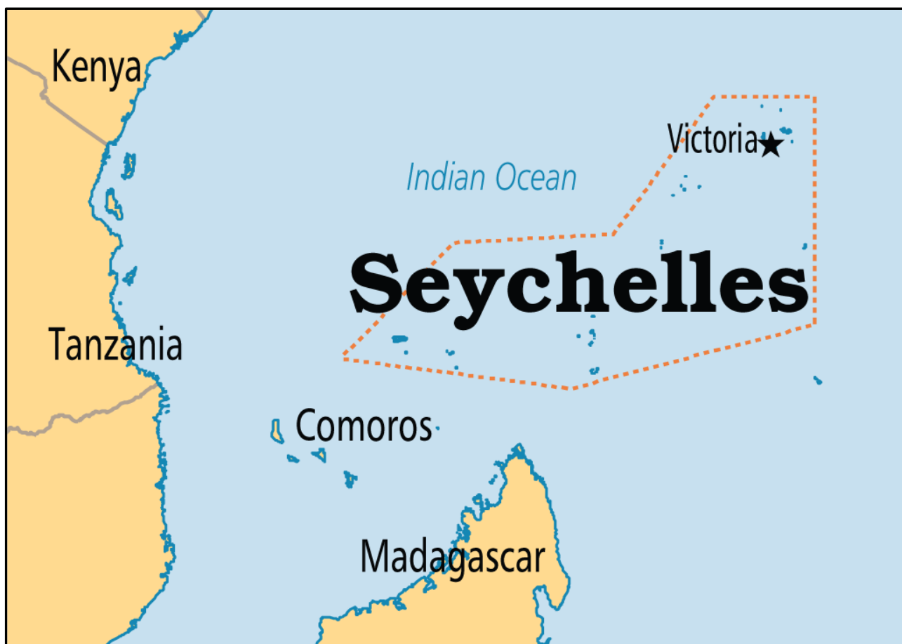
Figure 1: Seychelles schematic map and location