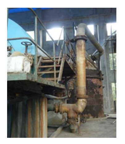
Figure 3. Sichuan Jinfu Bleaching Line after BAT/BEP Renovation