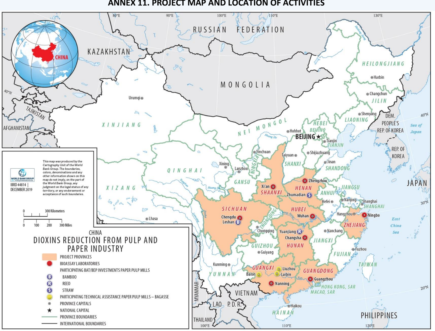
ANNEX 11. PROJECT MAP AND LOCATION OF ACTIVITIES