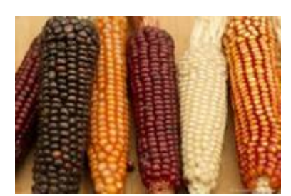
Maize varieties of Guatemala