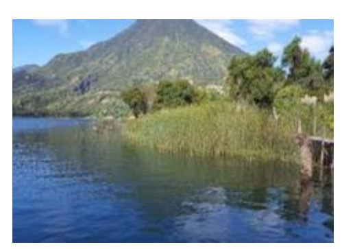
"Tul" plants in Lake Atitlan

There is an overall feeling of mistrust of Civil Society groups, Indigenous People and Local Communities, and the Public in general, towards the political "establishment", which is undermining the socio-political sustainability of the "ABS agenda".