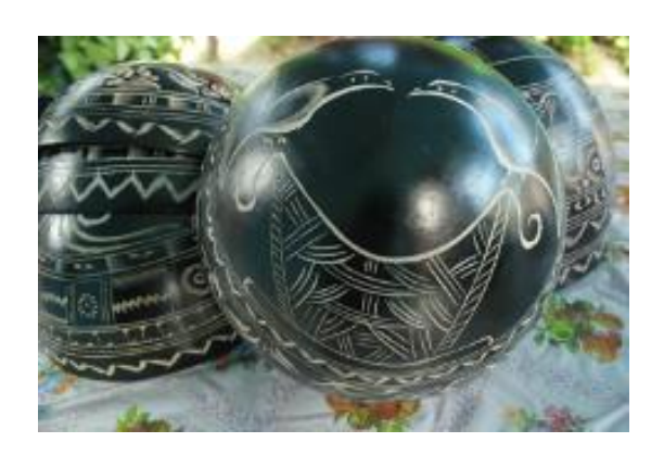
"calabash tree" (morro) artisanal products

Some initiatives for linking the use of local GR and TK with the socio-economic development of the rural communities, like the system "morro-nijil" (for the production of handcrafts from the "calabash tree") and the use of the "Tul" (aquatic plant of the Atitlan Lake for the enhancement of fish habitats and production of straw handcrafts).