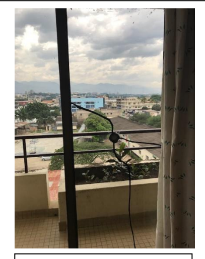
Figure 4. Bullet hole through one of the glass doors of the PADZOC PCU office in Bujumbura during the 2015 crisis.