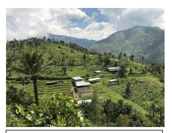
Figure 3. Rehabilitated & certified Musigati CWS under PADZOC.