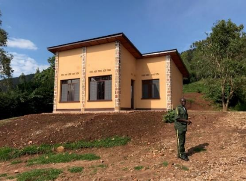
Figure 9. World Bank mission member standing in one of the established FFS under PADZOC.