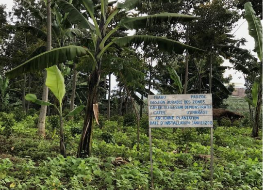
Figures 7 & 8. PADZOC shade-grown coffee demonstration sites at the ISABU Kayanza Research Station, showing coffee inter-cropping with agro-forestry trees and banana trees.