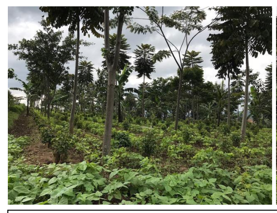
Figure 6. Replication of shade-grown coffee demonstration site by Feed the Hungry at the ISABU Kayanza Research Station.