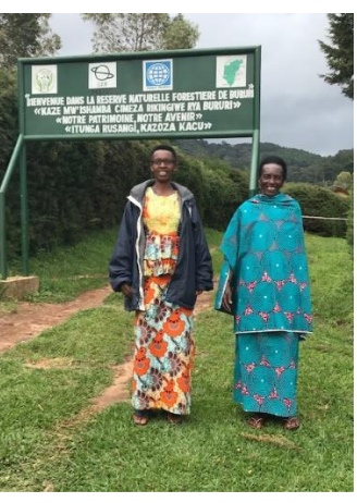
Figure 12. Female community group leaders in charge of protecting the Bururi Natural Reserve.