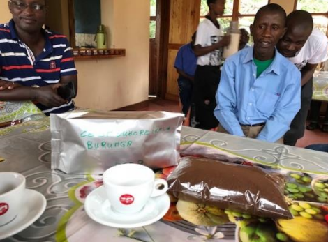
Figures 16 & 17. House of Coffee in Bururi funded under PADZOC.