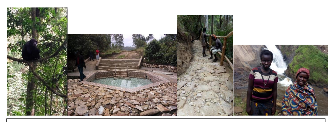
Figures 18, 19, 20 & 21. Eco and agro-tourism pilot initiatives supported by PADZOC in the Bururi Natural Reserve ( Left to right: Tracking of chimpanzees; Thermal waters rehabilitation; Path constructed by Batwas leading to waterfalls; Batwas posing with waterfalls in background.