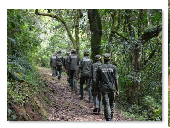
Figure 11. Eco-guards patrolling the Bururi Natural Reserve.