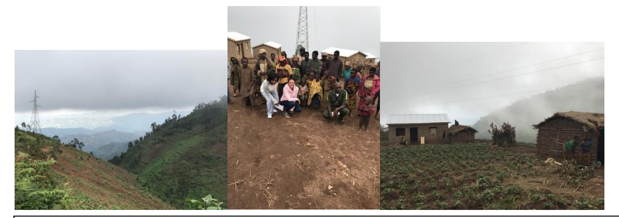
Figures 13, 14 & 15. Batwa indigenous community acquired land and newly constructed houses. The Batwa were supported by PADZOC and the new houses were funded by the PRODEMA Additional Financing.