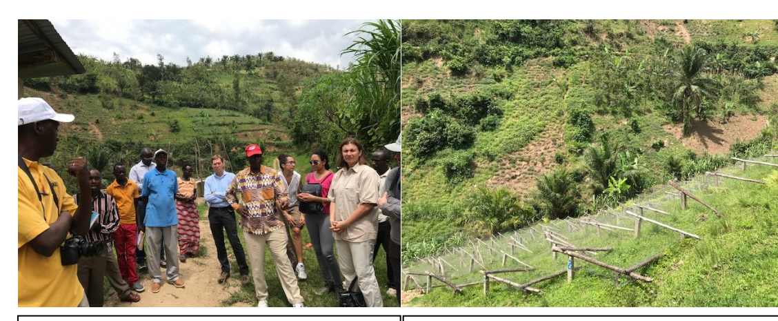
Figure 1. World Bank mission with members of the Musigati Coffee Washing Station Cooperative.