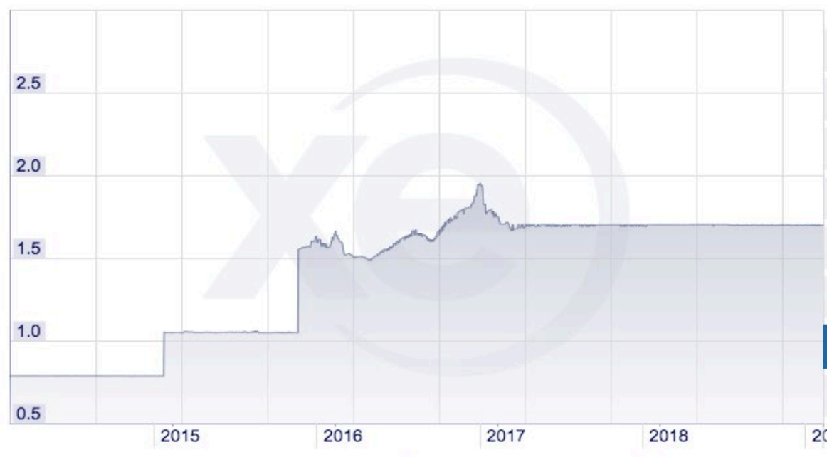
Figure 4 USD vs Azeri Manat Exchange Rate During Project Implementation