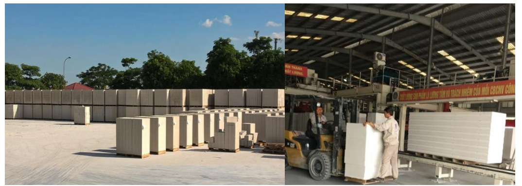
AAC bricks and AAC panel produced at Viglacera