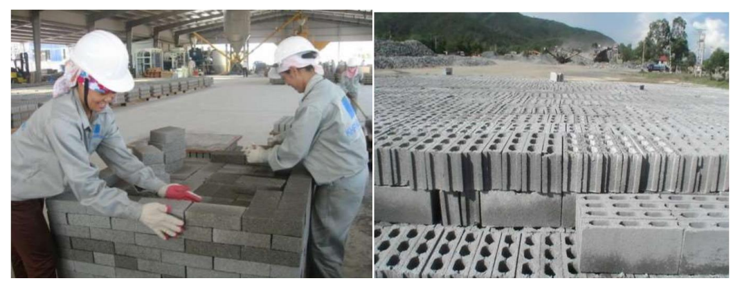
Hong Hoang Hong NFB Plant Production Expanded and Optimized