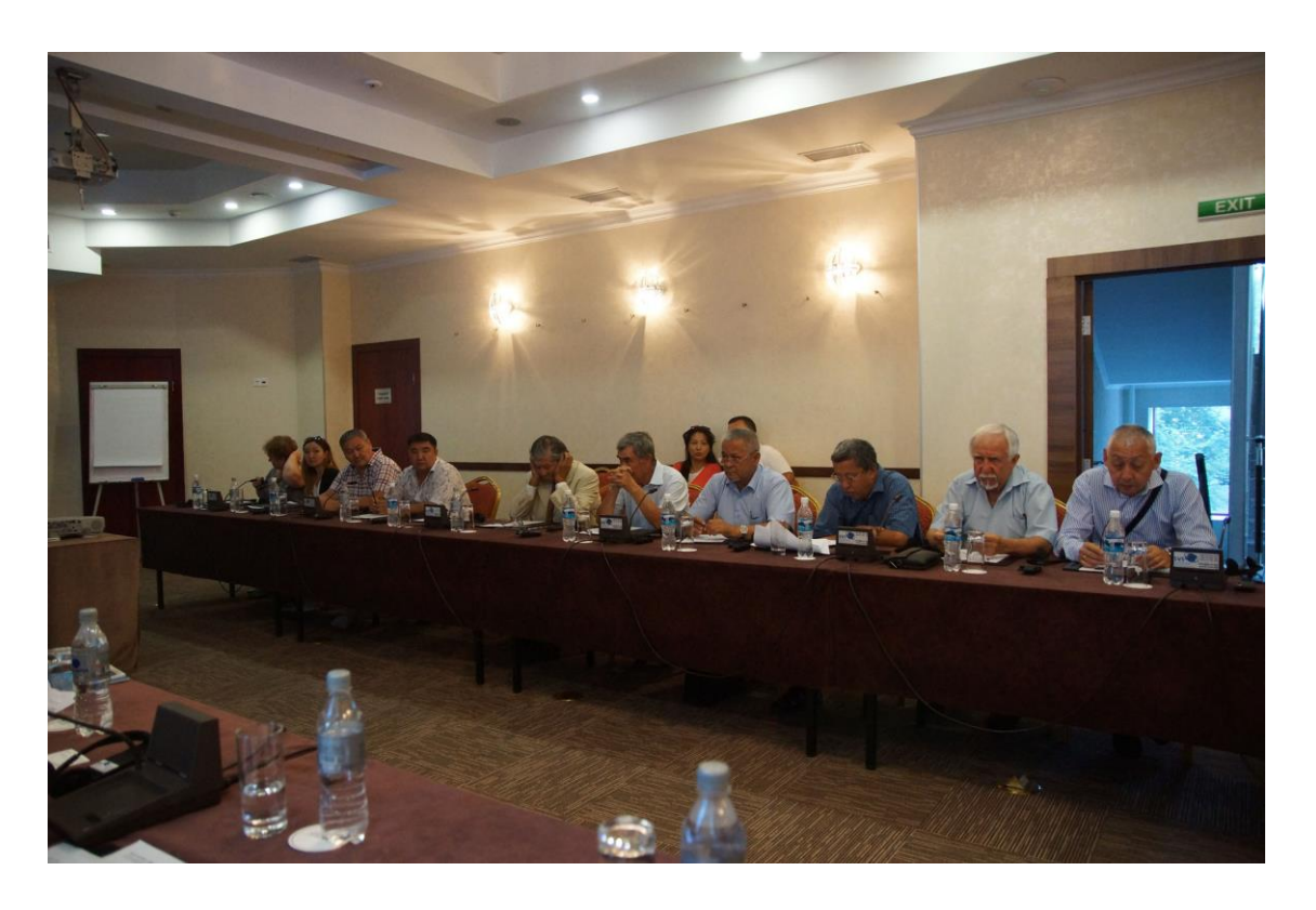
Picture 1. Steering Committee meeting in August 2017 where results of the project were reported to project stakeholders