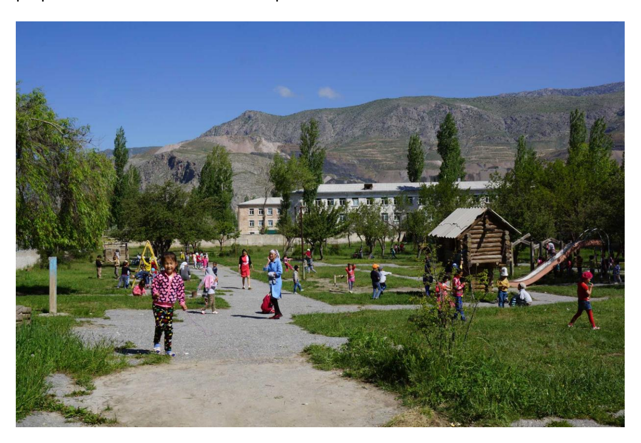
Picture 2. Children in the kindergarten of Khaidarkan, the health study did not indicated any of them being substantially exposed to mercury

103. The main critique on this project output concerns the number of examined residents that is much smaller than the original target – 201 against 5000. This was explained by the inability to do as many tests within the allotted budget and also low participation from the local residents. As a result although it was confirmed that significant portion of people working at the mercury factory are exposed to mercury, but there was almost no evidence that the local people have increased exposure. In opinion of the evaluator it is very likely that exposed people did not participate in the study. It is very important that the medical team did not have data on contamination of residencies of people they tested and therefore could not identify sources of residential exposure. Such issue maybe resolved in future initiatives by a more detailed medical monitoring that would involve much more people, e.g. the target number and testing primarily people who live in most contaminated parts of Khaidarkan.