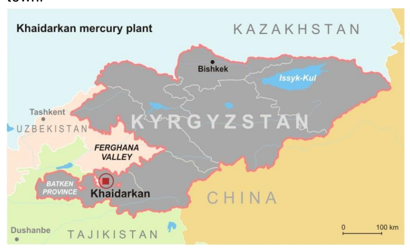
Figure 1. Location of the Project Area

closed completely and the administration is looking for ways to revive production. The mine and factory complex is located in Khaidarkan which was renamed to Aidarken in 2006. In the text the old name Khaidarkan is used to decrease confusion because the name of the enterprise remained "Khaidarkan mining factory" regardless of the change in the name of the town.