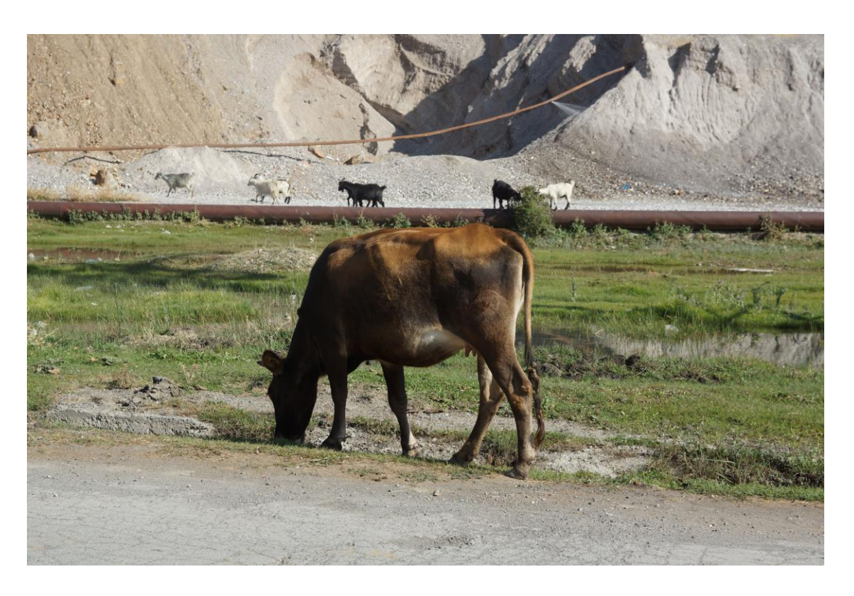
Picture 6. Herds of livestock pass by and graze right next to the pile of ignition residues – the most contaminated area in Khaidarkan