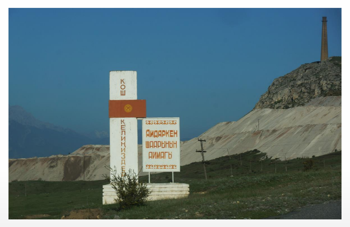
Evaluation Office of UN Environment May 2018