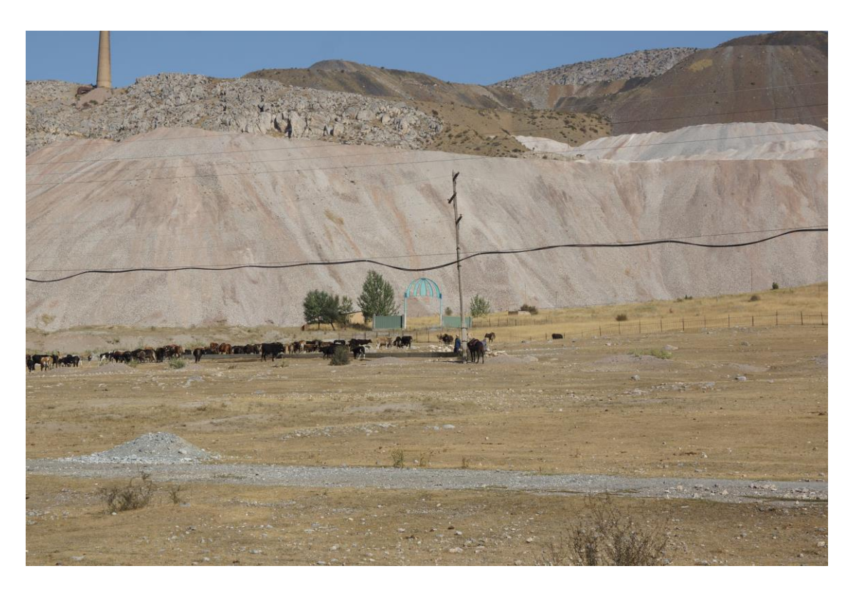
Picture 7. The fenced area is used for making reserves of forage for feeding cattle in wintertime, it is contaminated by mercury and such use should not be allowed.