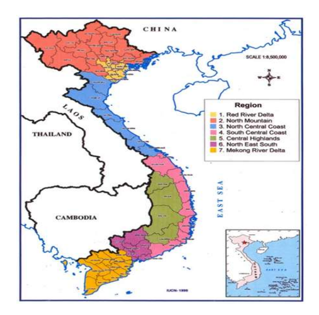
Figure 1. Map of Viet Nam

1990, contributing more than 40% to total fishery production and accounting for nearly 4% of Viet Nam's GDP in 2013 (VASEP, 2017).