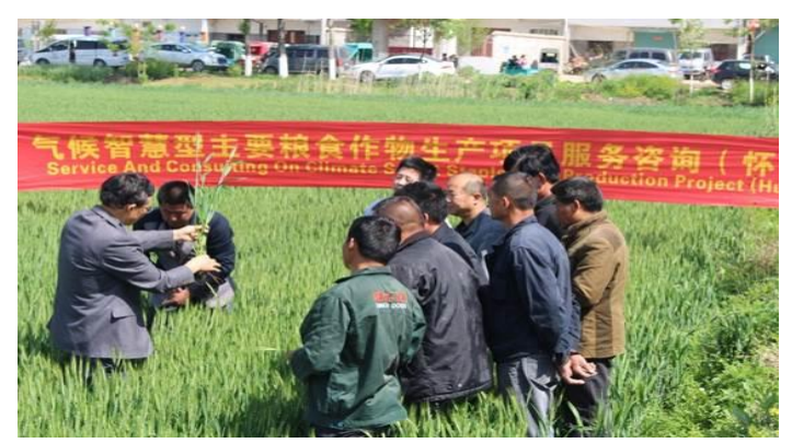
Farmers field school (IPM) in Huanyuan County