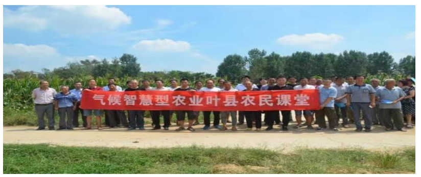
Farmers field school (fertigation) in Yexian County