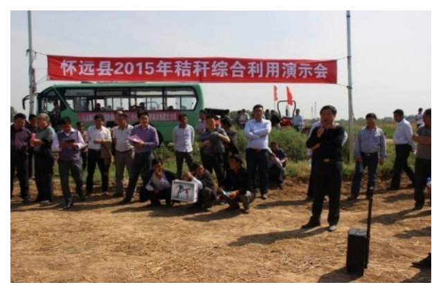
Crop residues returning to field demo in Huaiyuan County