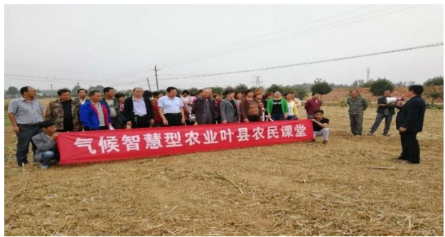
Field school on soil fertility test in Yexian County