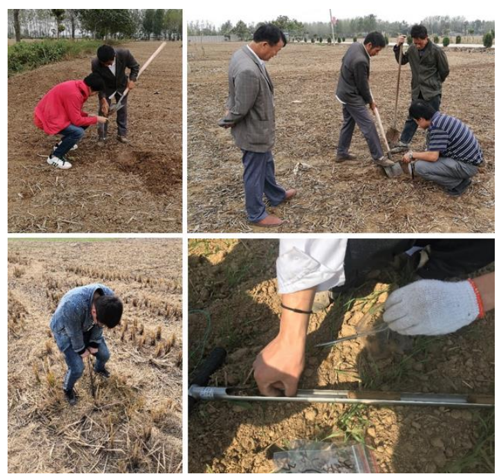
Figure 8.2. Sampling and monitoring for soil carbon