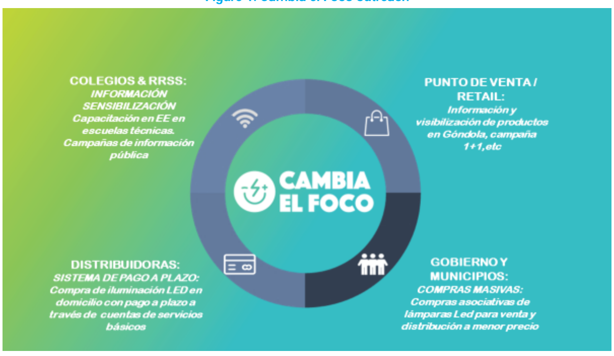
Figure 1: Cambia el Foco outreach