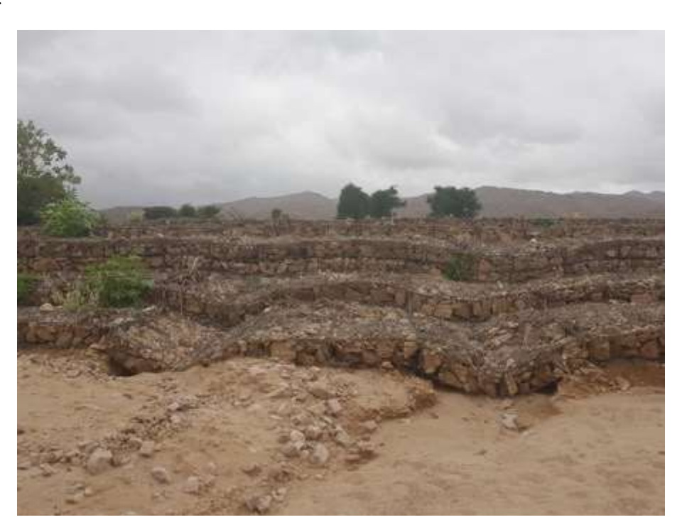
<u>Picture 2</u>. View from the upstream side of the Assamo micro-dam. The area where people are standing used to be 2 meters below the level of the micro-dam. Three years after its construction, sand and rocks carried by wadi waters filled this space, and the upstream wadi bed is now level with the micro-dam. Unless the height of the micro-dam is raised by adding another layer of gabions, it will soon be overflown by sand and rocks.

<u>Picture 1</u>. The micro-dam built in the wadi upstream of Assamo has been damaged from floods, and need to be maintained.