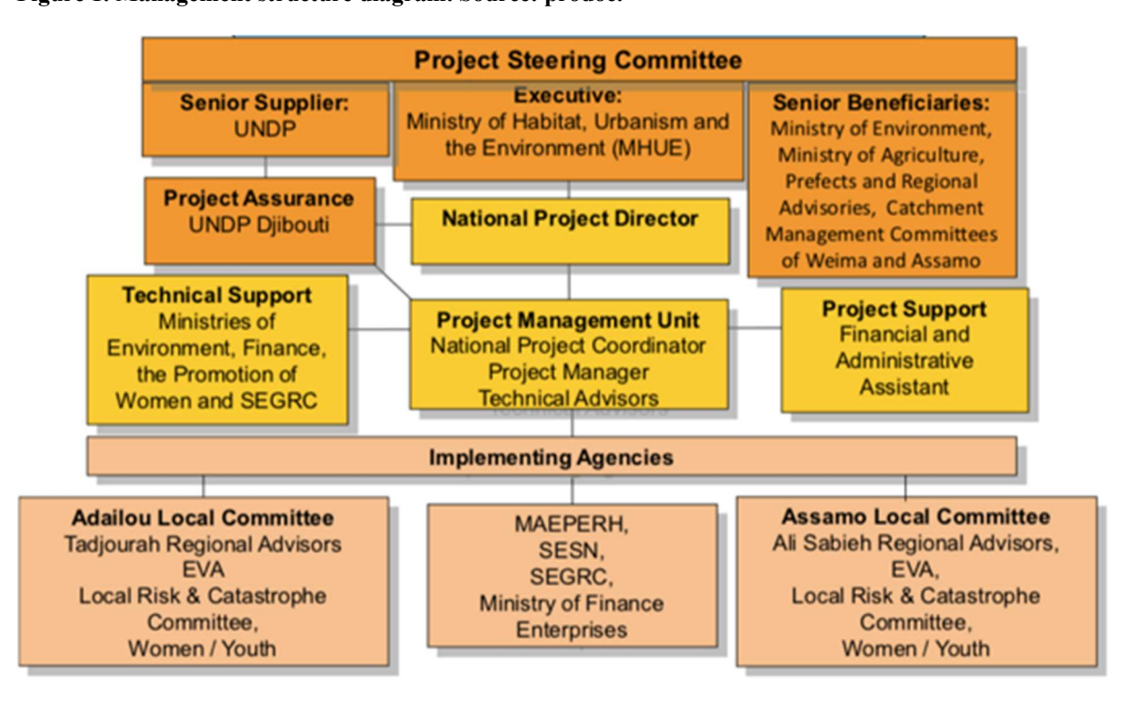
Figure 1. Management structure diagram.

The evaluators note a disconnect between the diagram and the narrative in the prodoc; the latter seems to have been taken from another project and not properly adapted to this project. For example, the RCs