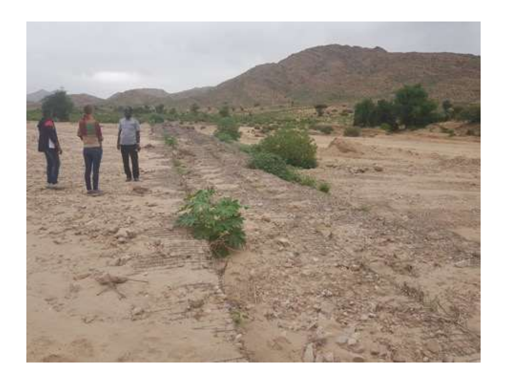
<u>Pictures 3a & 3b.</u> The two micro-dams built in Adailou are in good shape, and already proved useful to foster aquifer recharge.