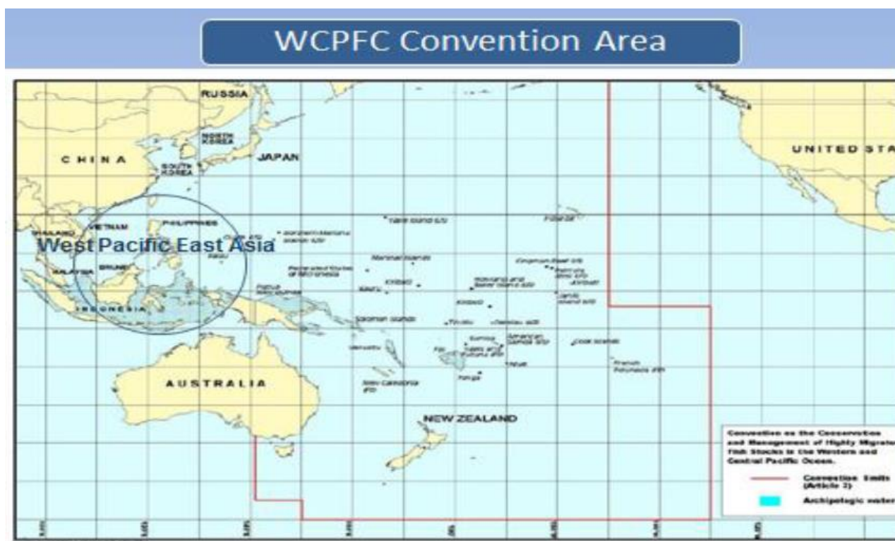
Exhibit 3: WCPFC Convention area including East Asian Seas 3

For the Exclusive Economic Zones (EEZs) of Indonesia, Philippines and Vietnam, connected with the POWP LME, the oceanic tuna catch 4 in 2012 was estimated at 632,000 metric tons, approximately 14 per cent of the global tuna catch and thus considered of global and regional significance. This comprises around 25% of the catch of skipjack, yellowfin and bigeye tuna in the Western and Central Pacific Ocean (WCPO), with significant catches of coastal tuna and associated species as well. Indonesia takes nearly 70% of that oceanic tuna catch, 5 Philippines takes 20%, and the balance is caught by the more recently developed Vietnam fishery.