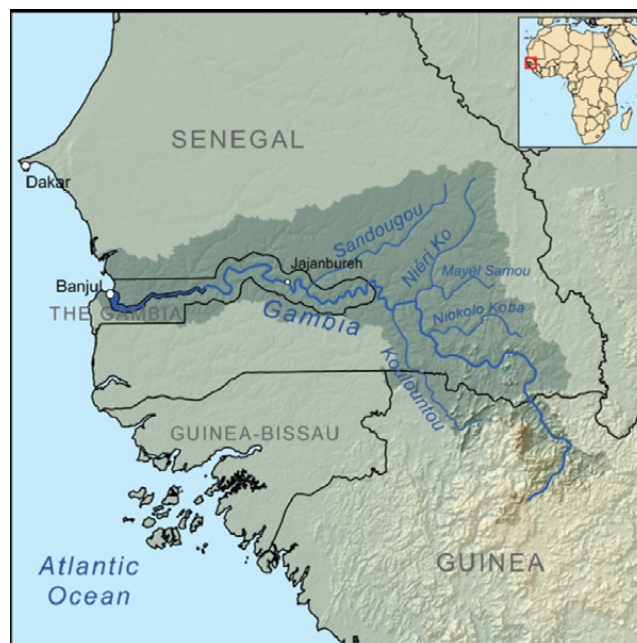
Figure 1. Location of the Gambia and the Gambia River Catchment