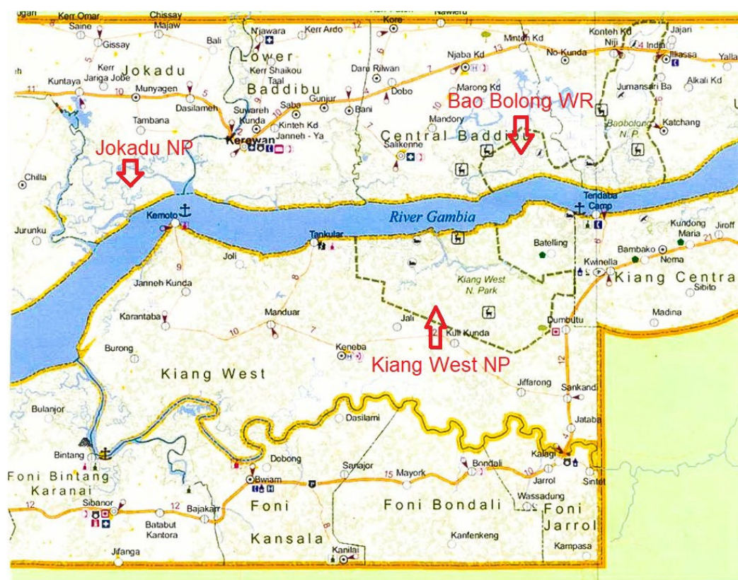
Figure 2. Locations of the three targeted PAs and surrounding towns, villages and countryside