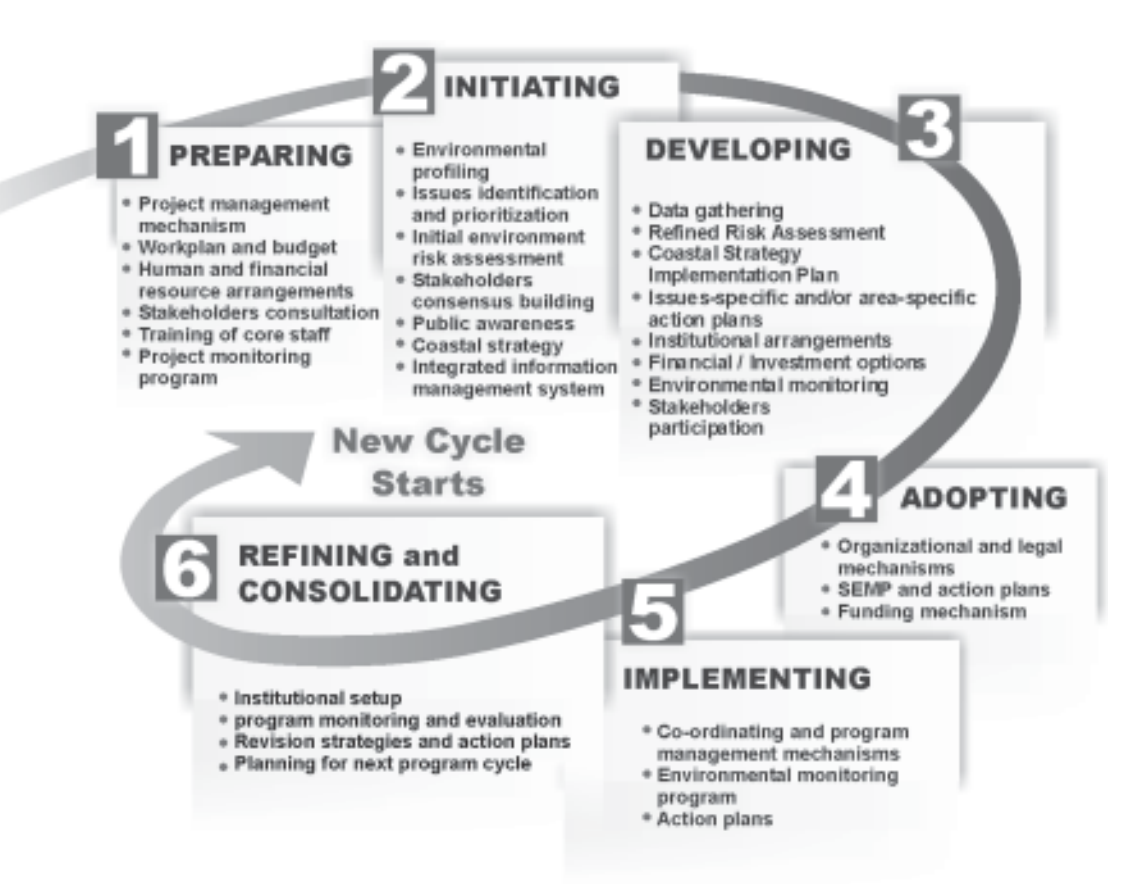
Figure 2. ICM Programme Cycle.