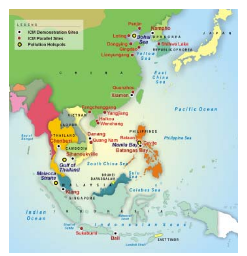
Map of the East Asian Seas Region.

The tourism industry is of major importance for most of the countries, with the coastal areas becoming large attractions also for the recreation of the population. Rapid urbanization of coasts has added to the pressure. Several coastal megacities have emerged, with large associated ports and economic power, but with it came significant poverty and large vulnerability. The financial crisis of 1997–1998 and globalization have stimulated further regionalization, brought the countries closer and expanded the political relationship between the economically, relatively stronger northern countries with the southern part, which has already been closely connected through ASEAN for over three decades.