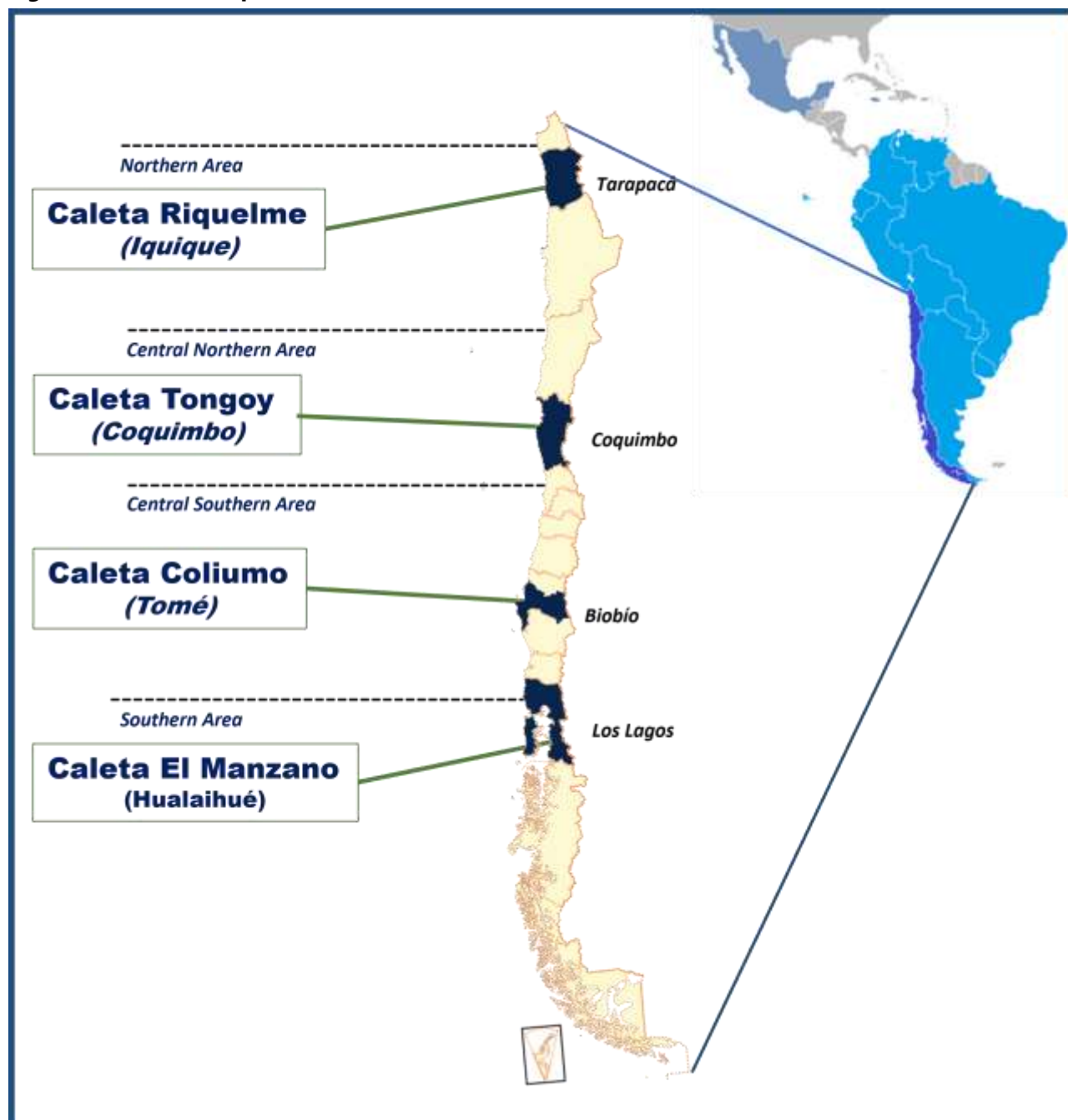
Figure 1. Location of pilot coves

Map conforms to UN. 2010. Map 4395 .