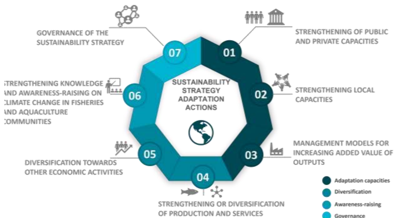
Figure 3. Strategic lines designed for the sustainability strategy