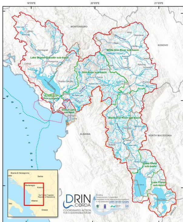
Figure 1: Map of the Extended Drin River Basin

The Drin Basin is located in the southwestern part of the Balkan Peninsula. It comprises the sub-basins of the White Drin, Black Drin, Drin and Buna/Bojana Rivers and of the Prespa, Ohrid and Skadar/Shkoder Lakes. The Drin River is the “connecting body” of the “extended” Drin Basin, linking the lakes, wetlands, rivers and other aquatic habitats into a single, yet complex, ecosystem of major importance. The water bodies and their watersheds are spread in a geographical area that includes Albania, Greece, North Macedonia, Montenegro and Kosovo. The total geographical area of the Drin Basin is 20,361 km 2 . The basin is characterized mainly by mountainous relief, the highest peaks of which are the Dinaric Alps at over 2,500 m above sea level, with the exception of the basin’s coastal area in Albania. The basin is home to over 1.61 million people, living in over 1,450 settlements. The extended basin therefore includes the three well known Balkan lakes of Prespa, Ohrid and Skadar -